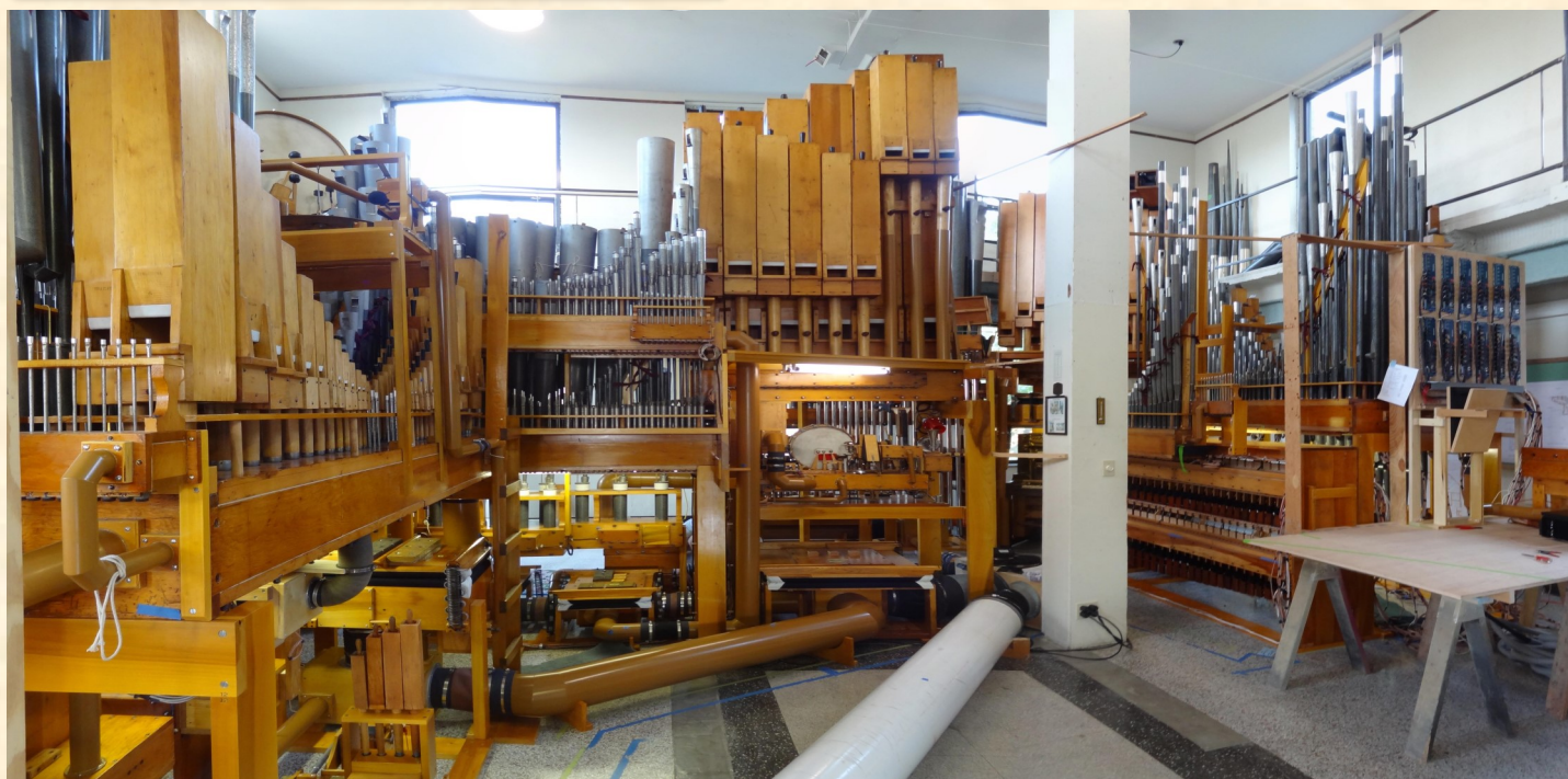
The Lerner Theatre Kimball organ was restored and reassembled and made playable in the Bunn-Minnick factory in Columbus, OH.