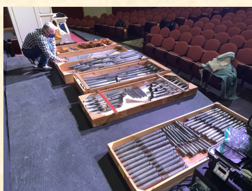
Main Chamber pipes removed for cleaning