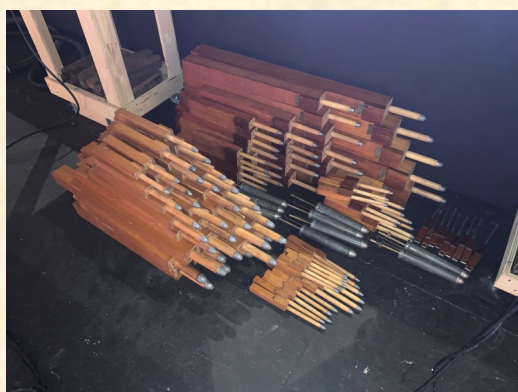
Wurlitzer Concert Flute and Kilgen Flute Celeste