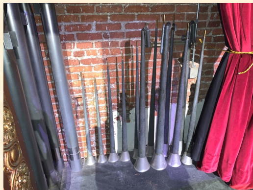
Gottfried French Trumpet resonators