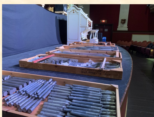
Another view of the Main Chamber pipes removed for cleaning