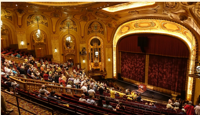
The magnificent Shea's Buffalo Theater with its 4/28 Wurlitzer