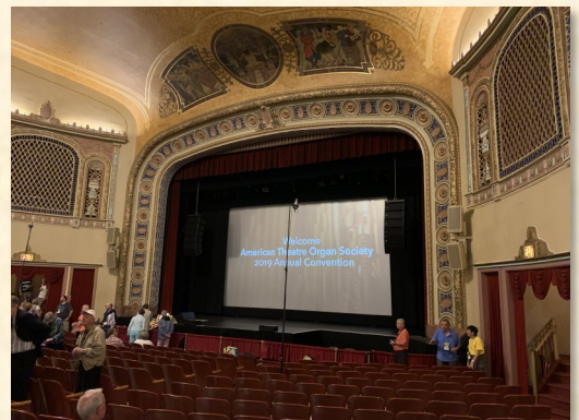
The Riviera Theatre and 3/15 Wurlitzer in North Tonawanda, NY