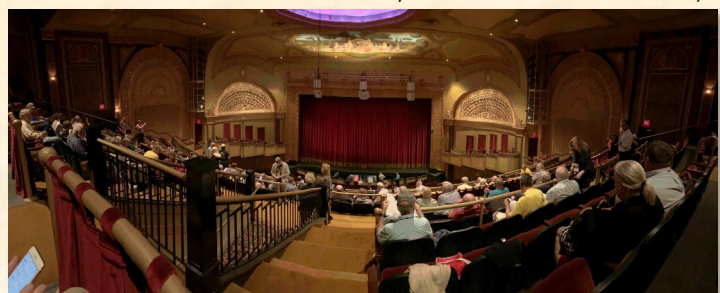
The Clemens Performing Arts Center and 4/23 Marr & Colton/Wurlitzer in Elmira, NY

SVTOS is a 501(c)(3) corporation dedicated to the preservation and presentation of Theatre Pipe Organs. Proudly supporting the Mighty Wurlitzer Theatre Pipe Organ at the Capitol Theatre in York, PA.