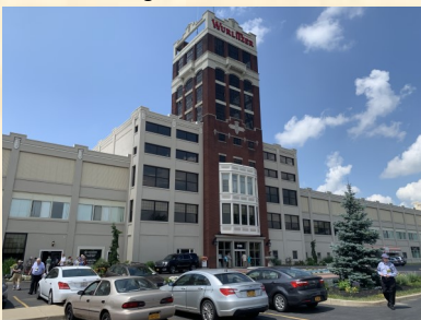
The former Wurlitzer factory in North Tonawanda, NY